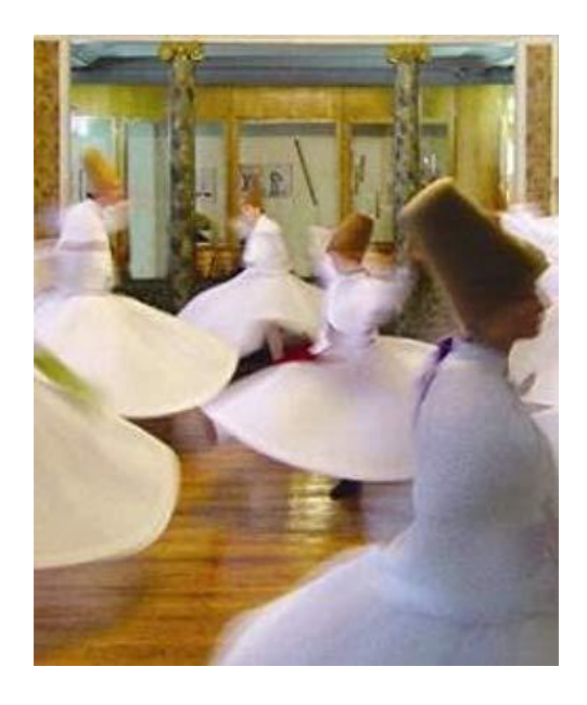
(Turkey; Mevlevis, are also known as Whirling Dervishes L)