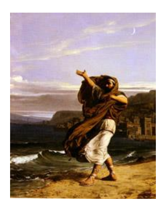
Demosthenes Practising Oratory (1870)