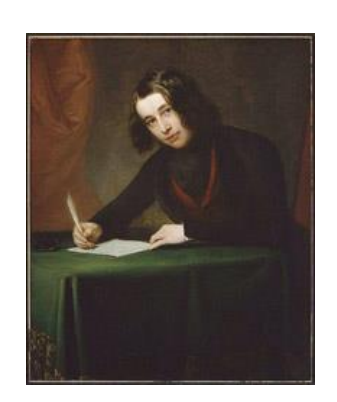
Charles Dickens (1842)